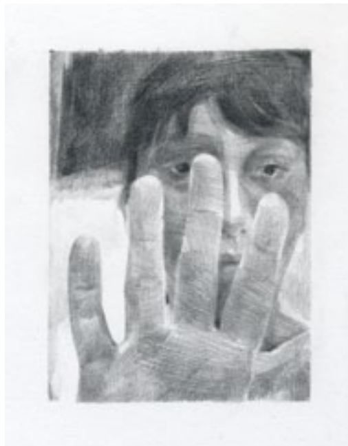
Pairs (C.B.) , 2016 pencil on paper, 35x55,8 cm, detail

Constantin Brâncuși (1876–1957) was one of the pioneering figures of modern sculpture and one of the most original artists of the twentieth-century. His serenely simplified sculptures Bird in Space , M-Ile Pogany or Sleeping Muse are unanimously recognised as icons of Modernism and, looking at his art now, it is almost impossible not to see him as a precursor to more recent work as diverse as that of Barbara Hepworth and Henry Moore, Anish Kapoor and Carl Andre, Donald Judd and Louise Bourgeois. He was a remarkably protean figure, also a close friend to leading avant-garde artists such as Amedeo Modigliani, Marcel Duchamp, Man Ray and Erik Satie, yet he remains one of the most elusive, with an aura of otherness still intriguing today.